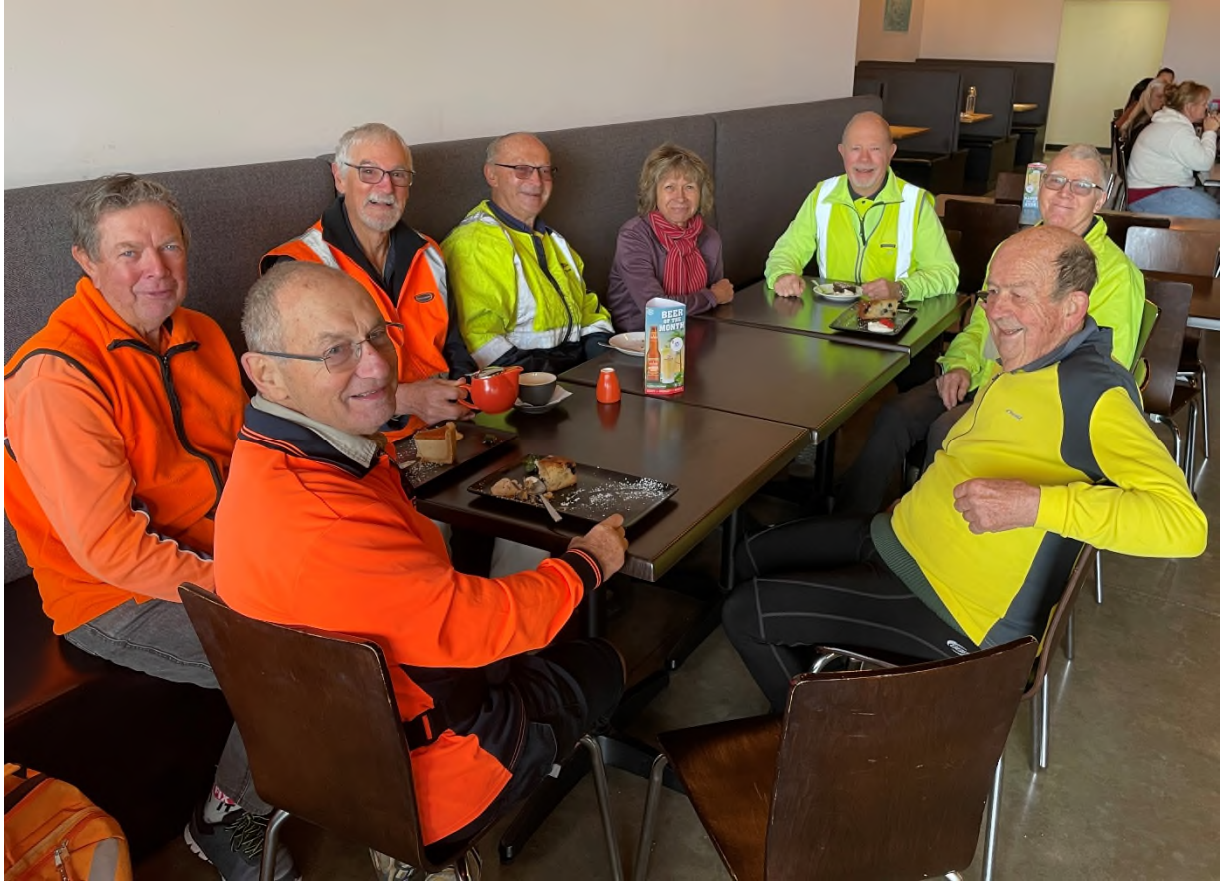
In the 'Purple Owl' cafe

Hi Everyone! Our wee bunch of loyal riders have been missing a few recently with Covid, recovering from surgical procedures, holidays etc. but we still manage our weekly 'cafe rides', unless the weather really is inclement. I haven't too much to report this month, but two rides which 'stand out' were our ride to East Perth, to a great cafe next door to the ABC studios, riding there via the Principal Shared Path (PSP) which runs from Gosnells, just outside our Shed, and going most of the way to Perth, running parallel to the railway line.....and the good news is....the section via 'The Crescent' in Maddington, is at long last under construction, with the route cleared of vegetation (very responsibly environmentally) and a long stretch of 'road base' was already in place last Thursday, so it shouldn't be long before it is complete. Several years ago, I contacted the Main Roads re this stretch, and was informed, the then emphasis, was on completing areas within a 16 kms radius of the Perth CBD.