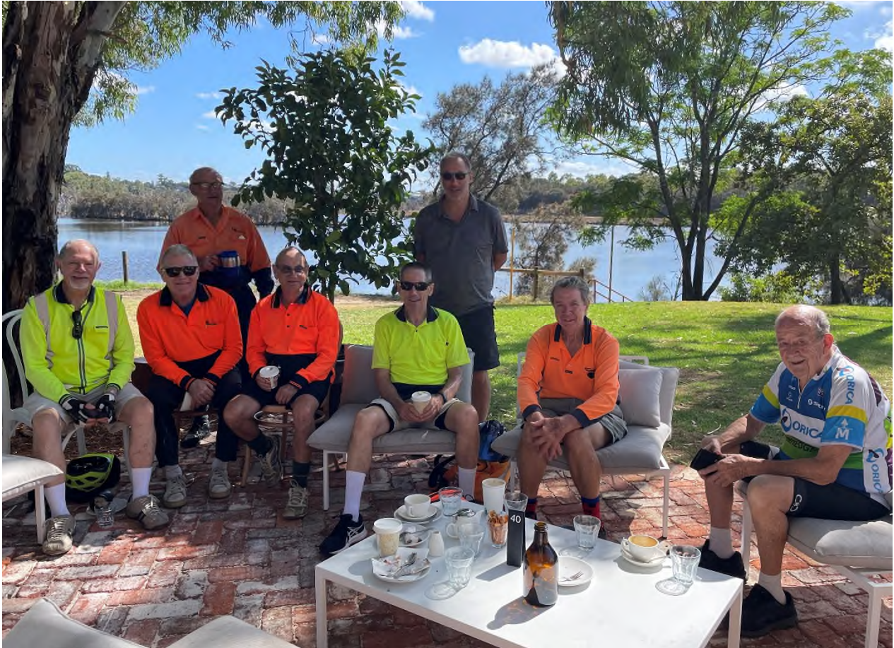
It is a hard life with this Cycling Group!