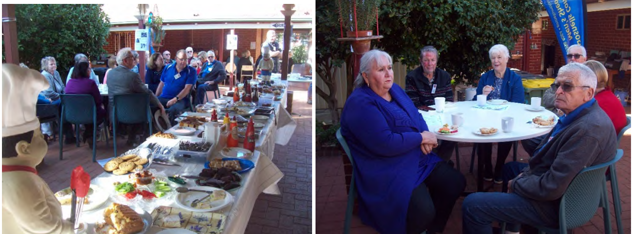
Some of the people who attended the Morning Tea and the spread of food people provided.

This amount has been donated to the Cancer Council WA.