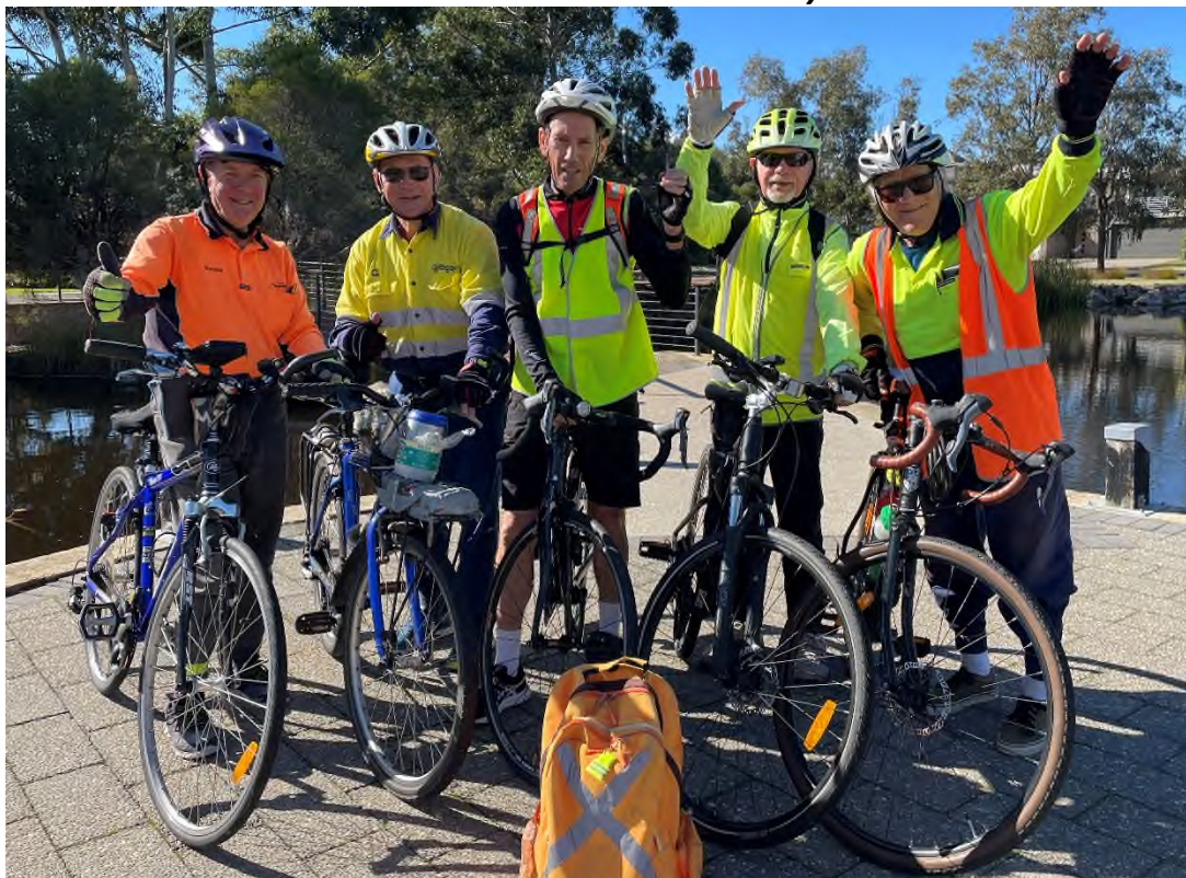
It is a hard life with this Cycling Group!

Australia is home to more than 1,500 species of spiders.