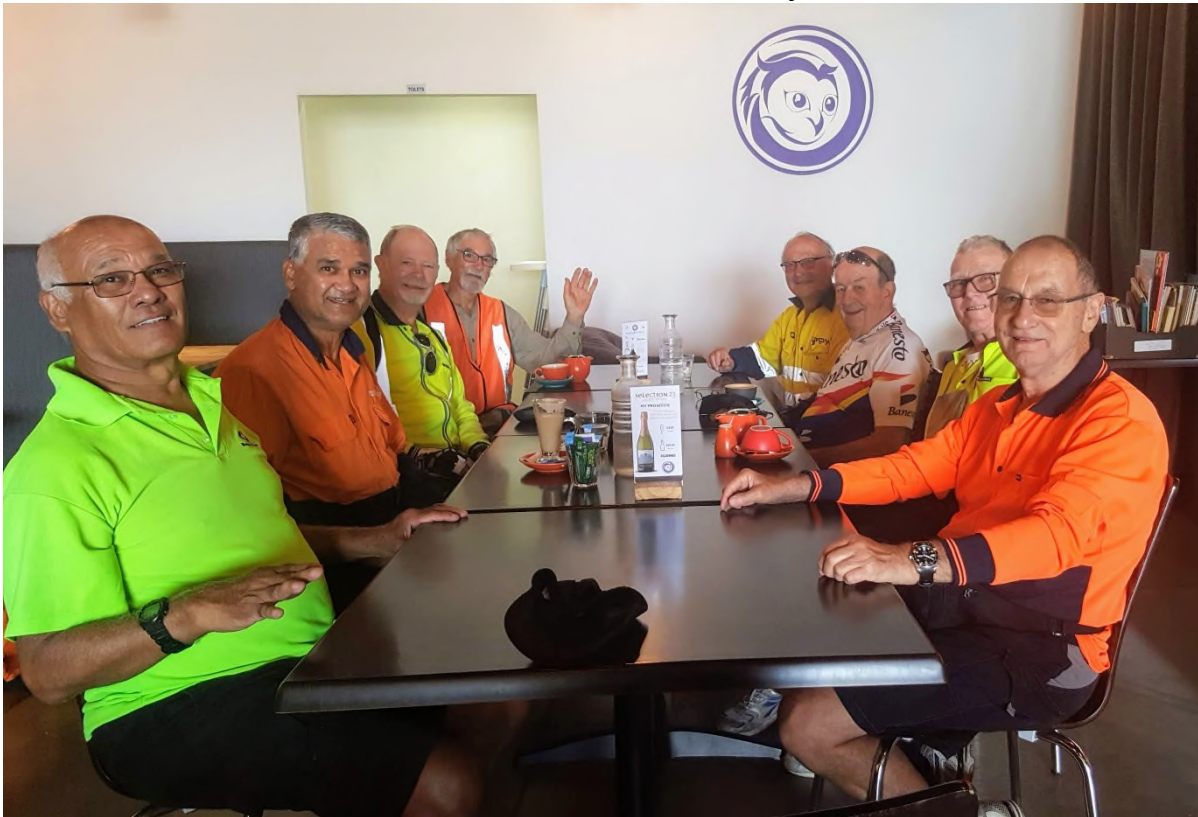
This photograph was taken 26 th November 2022