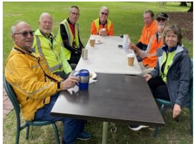
Coffee & Cake at Tomato Lake